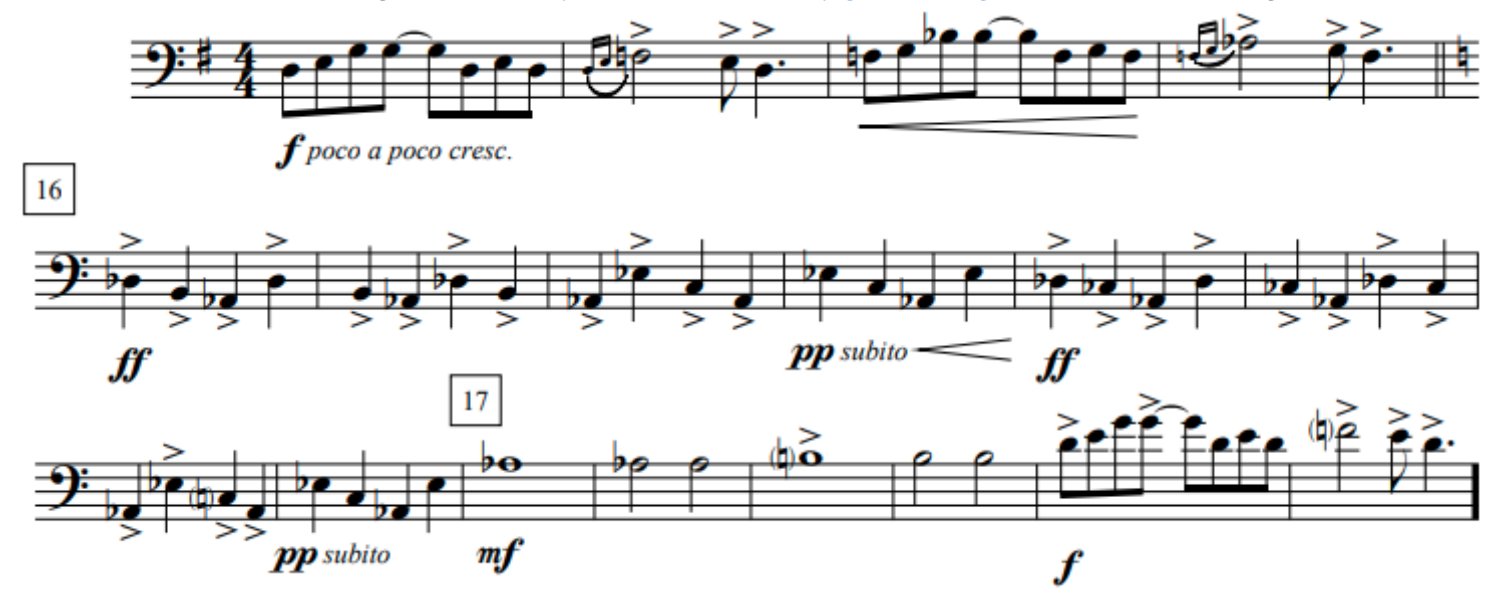
Excerpt 2b – Gershwin: Rhapsody in Blue, last 7 bars Time signature is 4/4, Quarter ≈ 64 Sample recording: <a href="https://youtu.be/2Bdyg-uJSRg?t=972">https://youtu.be/2Bdyg-uJSRg?t=972</a>

Sample recording: <a href="https://youtu.be/2Bdyg-uJSRg?t=334">https://youtu.be/2Bdyg-uJSRg?t=334</a> (through 6:02)